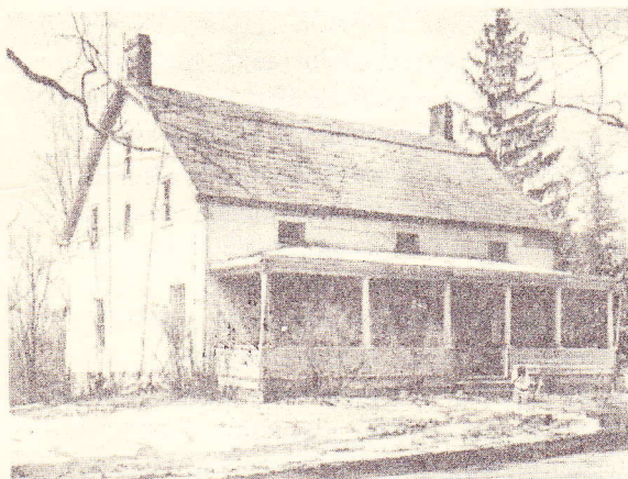
The Andries DuBois House on River Road in Wallkill, built in 1769, is undergoing restoration by the Historical Society of Shawangunk & Gardiner.

Annual picnic – at the Shawangunk Correctional Activity Center, Birch Road