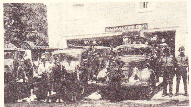
This photograph (believed taken in 1964) shows members of the Wallkill Hook, Ladder and Hose Company in front of the old firehouse on Bridge Street.

Over the years, many residents have volunteered and presently there are approximately 50 active members. The department uses four modern pieces of fire apparatus which include two pumpers, a pumper/tanker, and a heavy duty rescue truck. The department stands ready 24 hours a day, 365 days a year to protect lives and property, as it has for over 100 years.