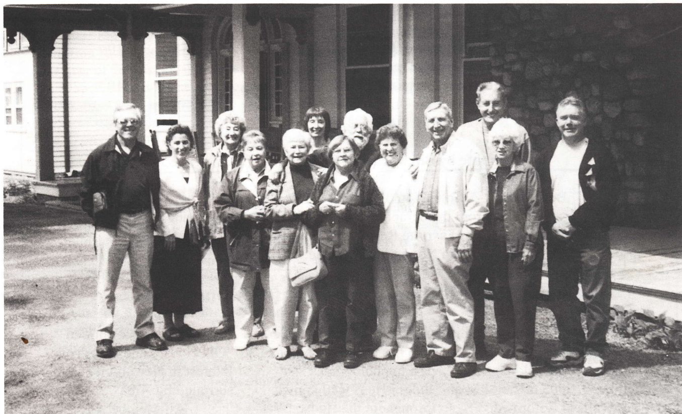
Society's First Guided Tour of Borden Mansion in June